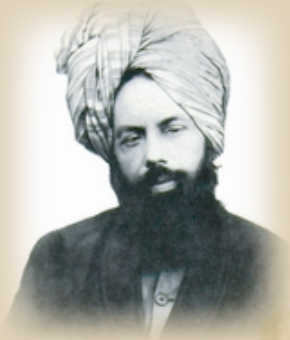
Hadhrat Mirza Ghulam Ahmad

The Ahmadiyya Muslim Community is a religious organization, international in its scope, with branches in over 178 countries in Africa, North America, South America, Asia, Australasia, and Europe. This is the most dynamic denomination of Islam in modern history, with worldwide membership exceeding tens of millions.